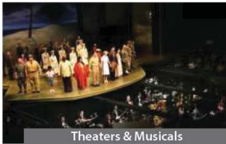
Theaters & Musicals