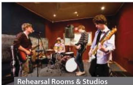
Rehearsal Rooms & Studios

myMix CONTROL, the web browser based software, completes the system by offering the engineer the capability to back up a whole system, configure and edit individual units, or lock specific functions through any device that accesses the network wired or wireless.